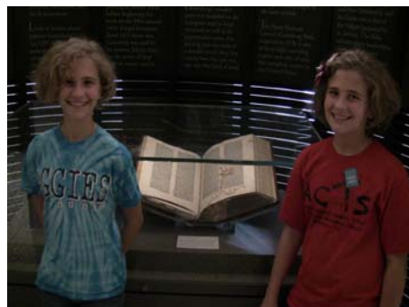
Inside the Harry Ransom Center with a The Gutenberg Bible (we had a couple of young history buffs join us)