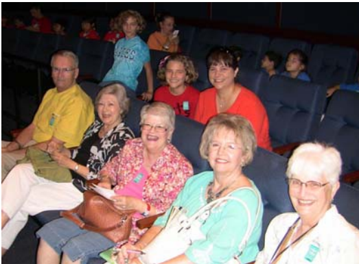
Inside the Bob Bullock Museum